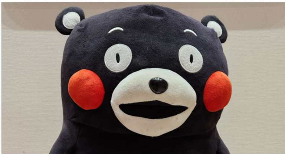
Kumamon (Kumamoto Prefecture's mascot)

I always try to experience new things and explore more of Japan so my favourite story would probably be related to Kumamon. There's a running joke in the Kumamoto JET community. If we leave Kumamoto, whether it's within Japan or overseas, you will find him somewhere. Rather he comes to find you.