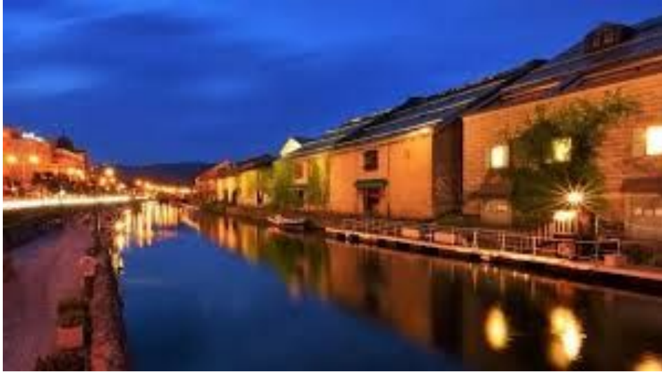
Night view of Otaru